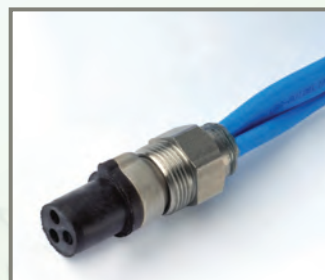
POWER FEEDING CABLE